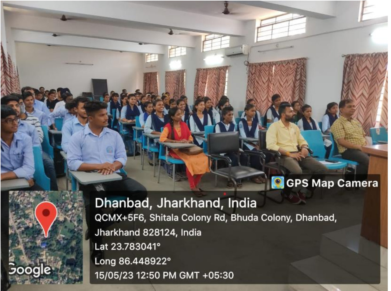
Participation of students and faculty members